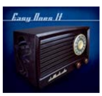
EASY DOES IT Our latest CD release